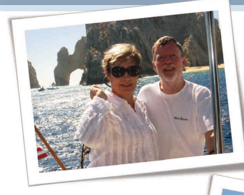
"We snorkeled Islotes last week and it was the most fish we have seen anywhere in Mexico!"